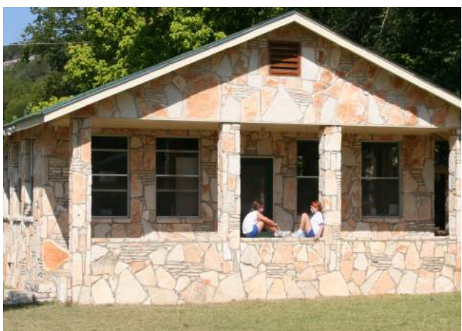
"Wiggle Inn" is a junior cabin.

The cabins at Camp Mystic are built out of native stone. Mystic has twenty-three cabins in all: thirteen cabins on the "Flats," where junior and intermediate campers live, and ten cabins on "Senior Hill," where high intermediate and senior campers reside. Two or three counselors live in each cabin with the campers. Daily cabin inspections encourage campers to keep their cabins clean. All cabins have their own complete bathrooms, hot showers, and electricity.