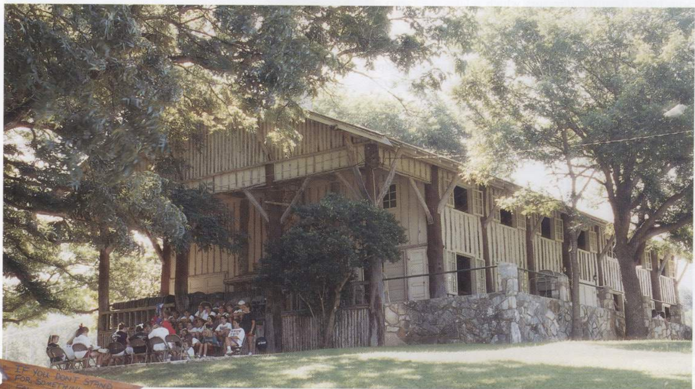
Campers meet for stunts, dancing, plays and movies in Rec Hall.