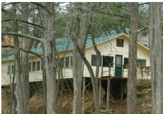
"Hangover" is a cabin for the oldest campers.