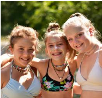
Beauty Inside & Out