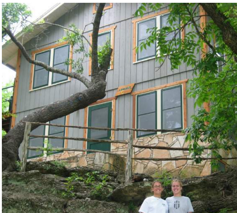
"Look Out" and "Look Out Nest" are cabins where high intermediate campers reside.

The cabins at Camp Mystic are built out of native stone. Mystic has twenty-three cabins in all: thirteen cabins on the "Flats," where junior and intermediate campers live, and ten cabins on "Senior Hill," where high intermediate and senior campers reside. Two or three counselors live in each cabin with the campers. Daily cabin inspections encourage campers to keep their cabins clean. All cabins have their own complete bathrooms, hot showers, and electricity.