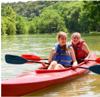
Canoeing & Kayaking