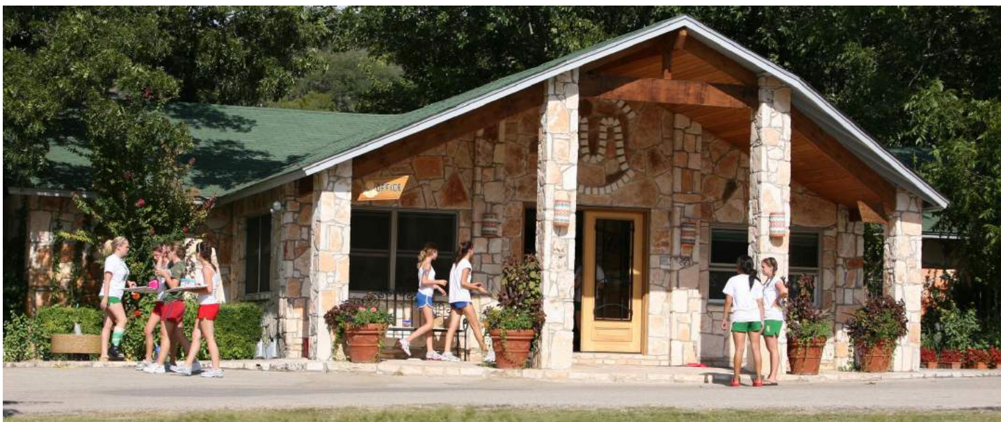
Campers, counselors, and visitors have easy access to the Camp Mystic Directors and Staff in the office.