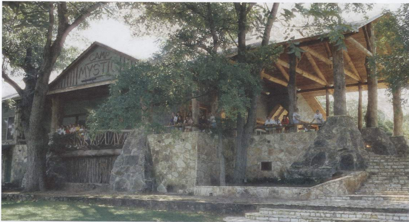
Giant pecan trees shade Harrison Hall, where Mystic campers and counselors enjoy three meals a day served family style.