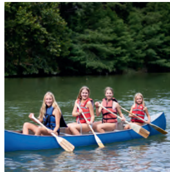
CANOING & KAYAKING