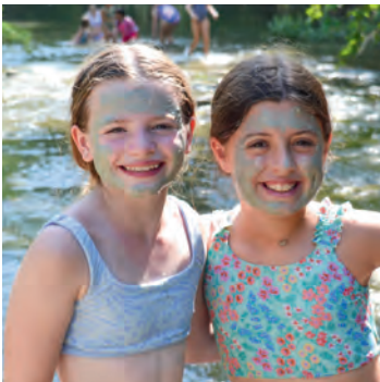
BEAUTY INSIDE & OUT