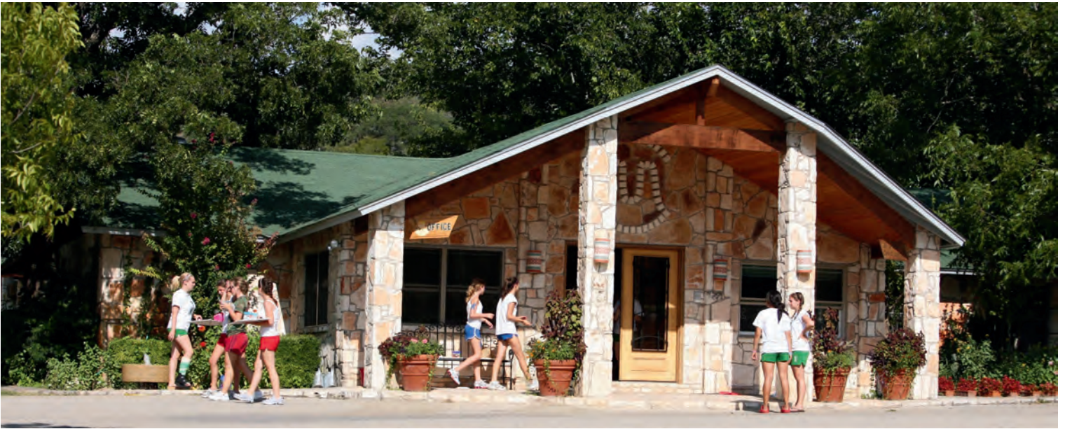
Campers, Counselors, and visitors have easy access to the Camp Mystic Directors and Staff in the camp offices.