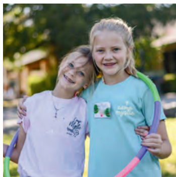
FUN & GAMES